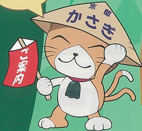
Sightseeing Ambassador of Kasagi Town: "Kasa-Yan"